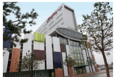
Hampton by Hilton Liverpool John Lennon Airport