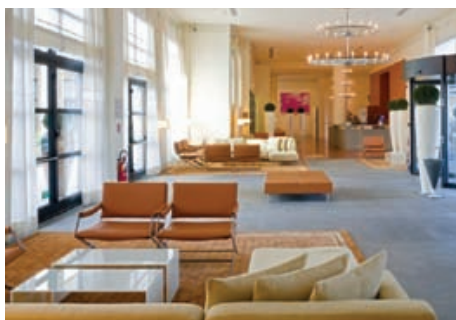
Hilton Garden Inn Florence Novoli