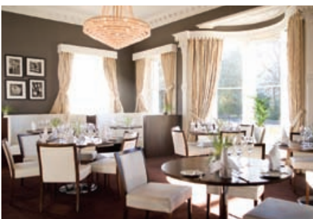
Doubletree by Hilton Chester