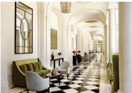
Trianon Palace Versailles. Waldorf Astoria Collection